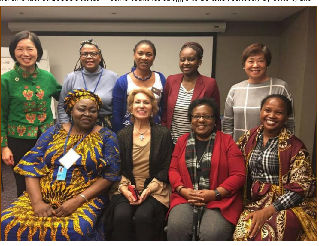
er in the Church Centre for Some of our lovely Anglican delegates at UNCSW62

I attended several presentations and panel discussions concerned with gender in the media. Female journalists from some countries struggle to be taken seriously by editors, and